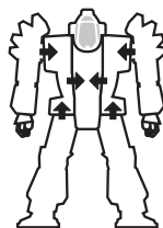
Damage Transfer Diagram